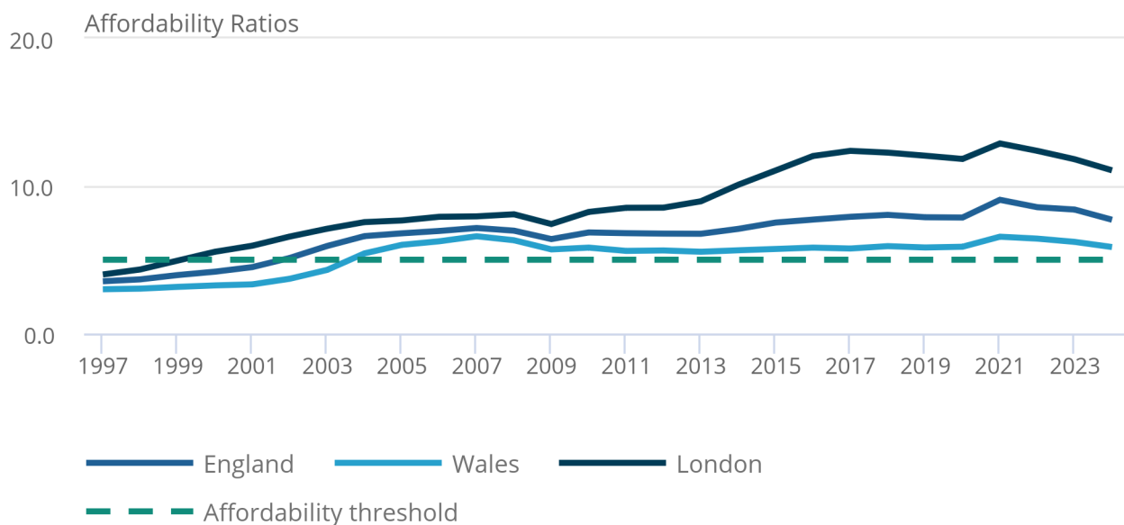
Housing affordability ratio by country, 1997 to 2024