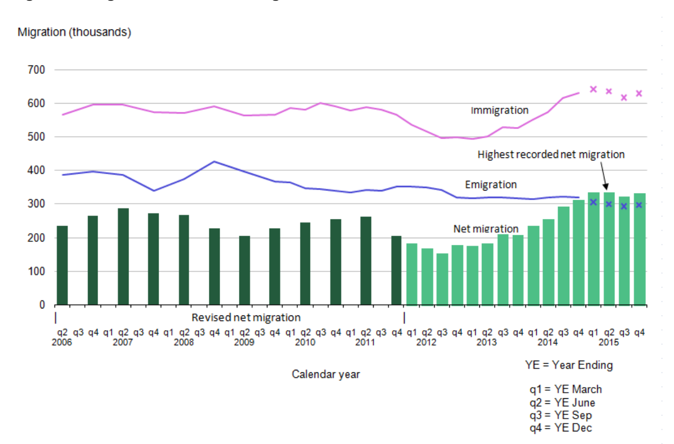
Figure 1: Long-Term International Migration for the UK, 2005 to 2015

Net migration is the difference between the estimated number of immigrants arriving to the UK for at least 1 year and the estimated number of emigrants leaving the UK for at least 1 year. Figure 1 shows rolling annual estimates from the year ending June 2005 onwards. Latest provisional estimates show net migration was +333,000 in the year ending December 2015.