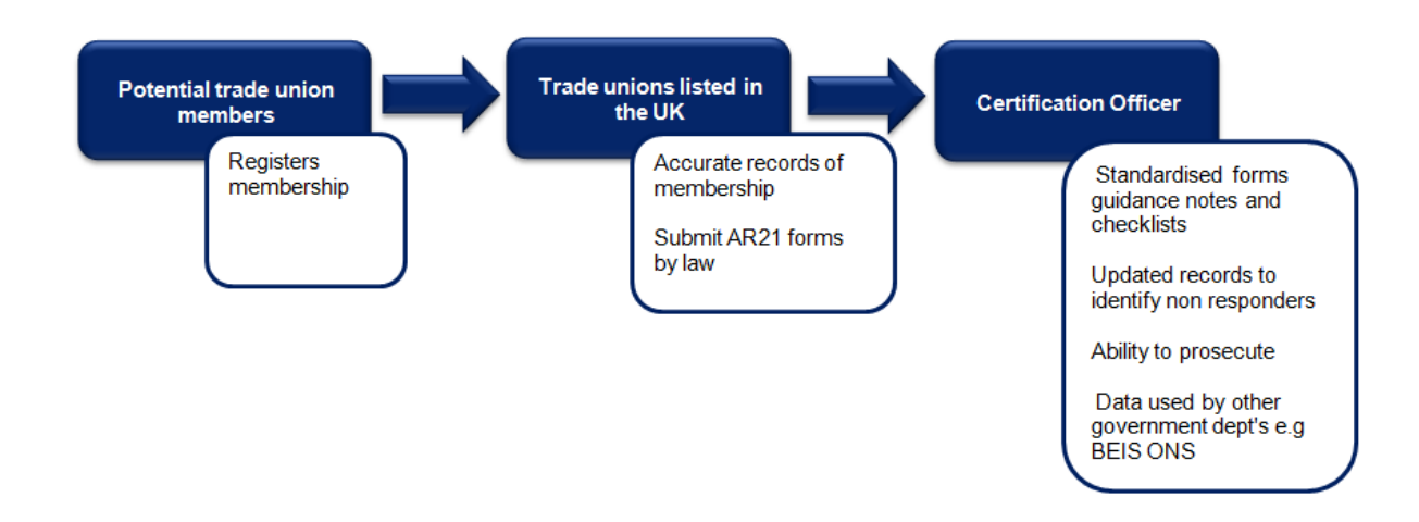
Figure 4: Process map showing the flow of communication between data suppliers to output producers