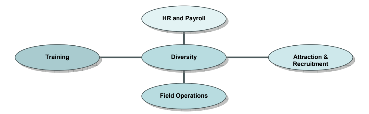
Figure 2: Overall diversity strategy approach

To facilitate the process described above, the aim of the EqIA is to form an interlinking with the overall strategic approach diversity has across all workstreams (see diagram below) using recruitment as its main link-in as fig 2 shows: