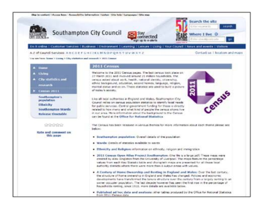
Image: example of a local authority publicising the 2011 Census results, Southampton CC