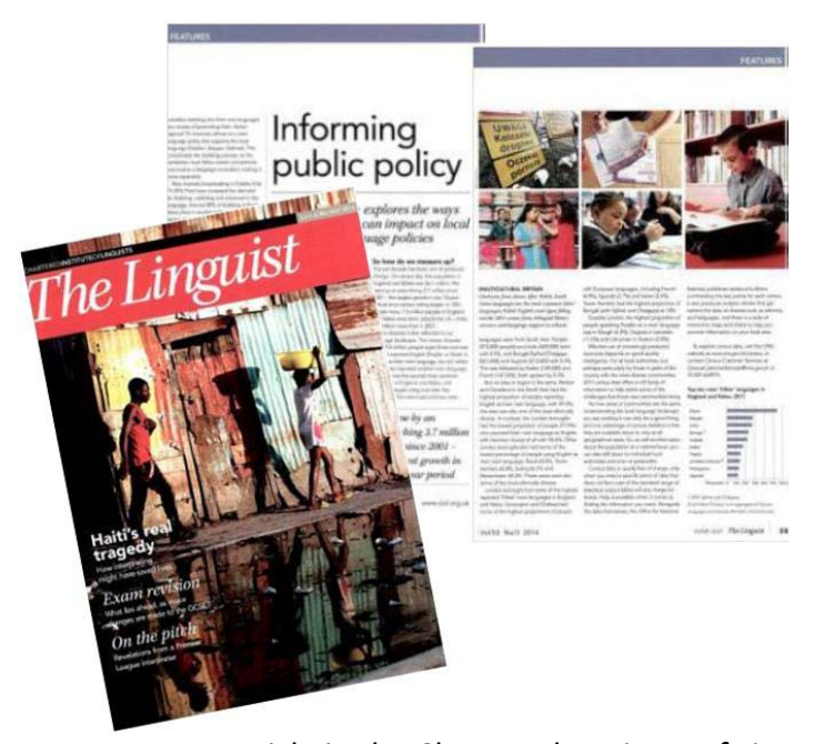
Image: census article in the Chartered Institute of Linguists magazine 'The Linguist'

Representative/membership organisations have also proved to be important intermediaries to reach to individuals from specific industries/professions. Census editorial features in membership magazines and on websites helped to reach professionals with a potential interest in census data, including Chartered Institute of Public Relations (CIPR) and the Chartered Institute of Linguists.