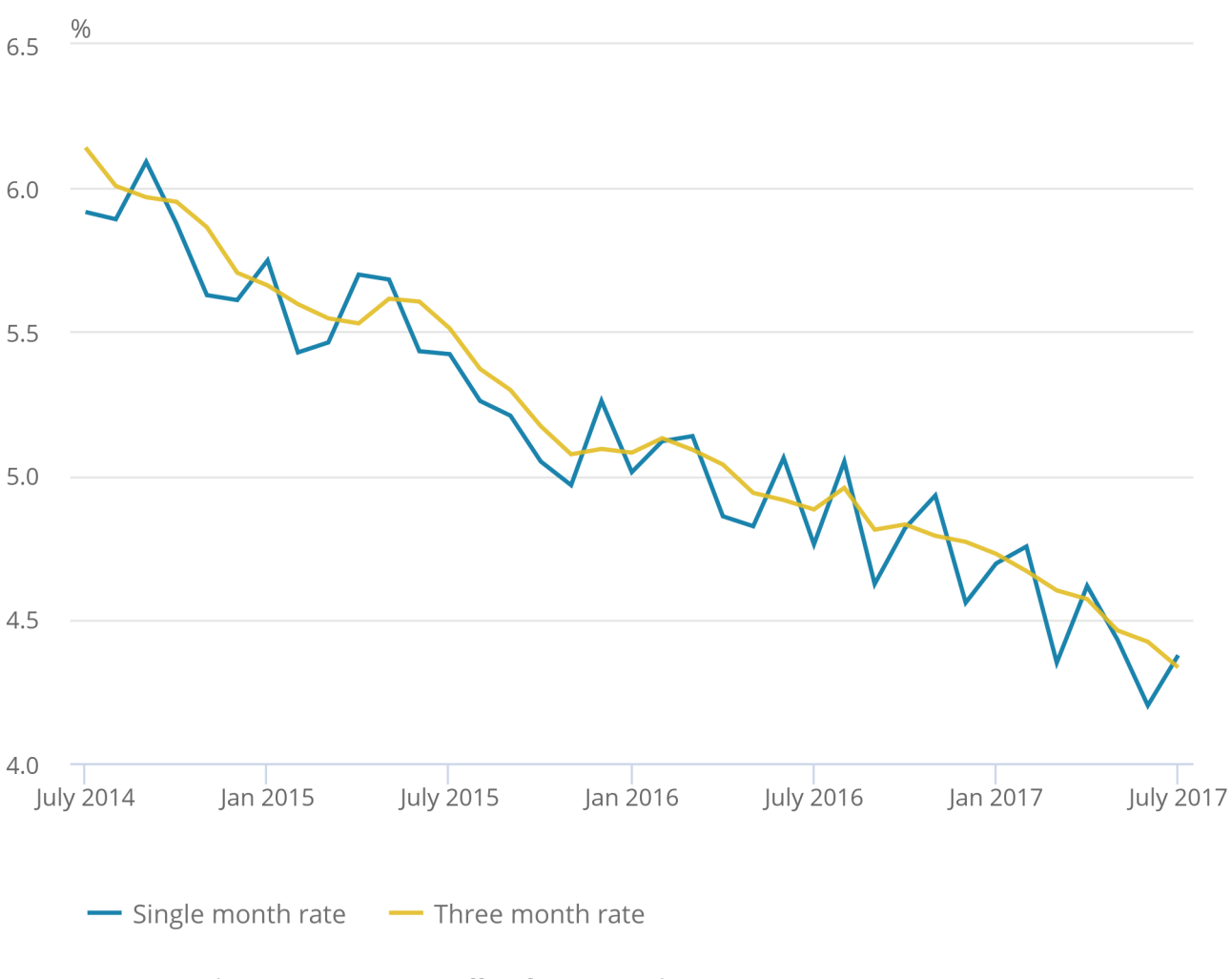
Figure 2: UK unemployment rates (ages 16 and over), (seasonally adjusted), July 2014 to July 2017