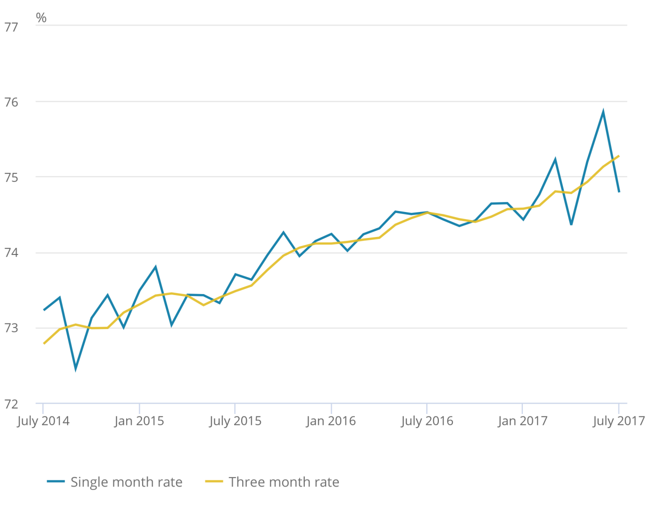
Figure 1: UK employment rates, ages 16 to 64 (seasonally adjusted), July 2014 to July 2017