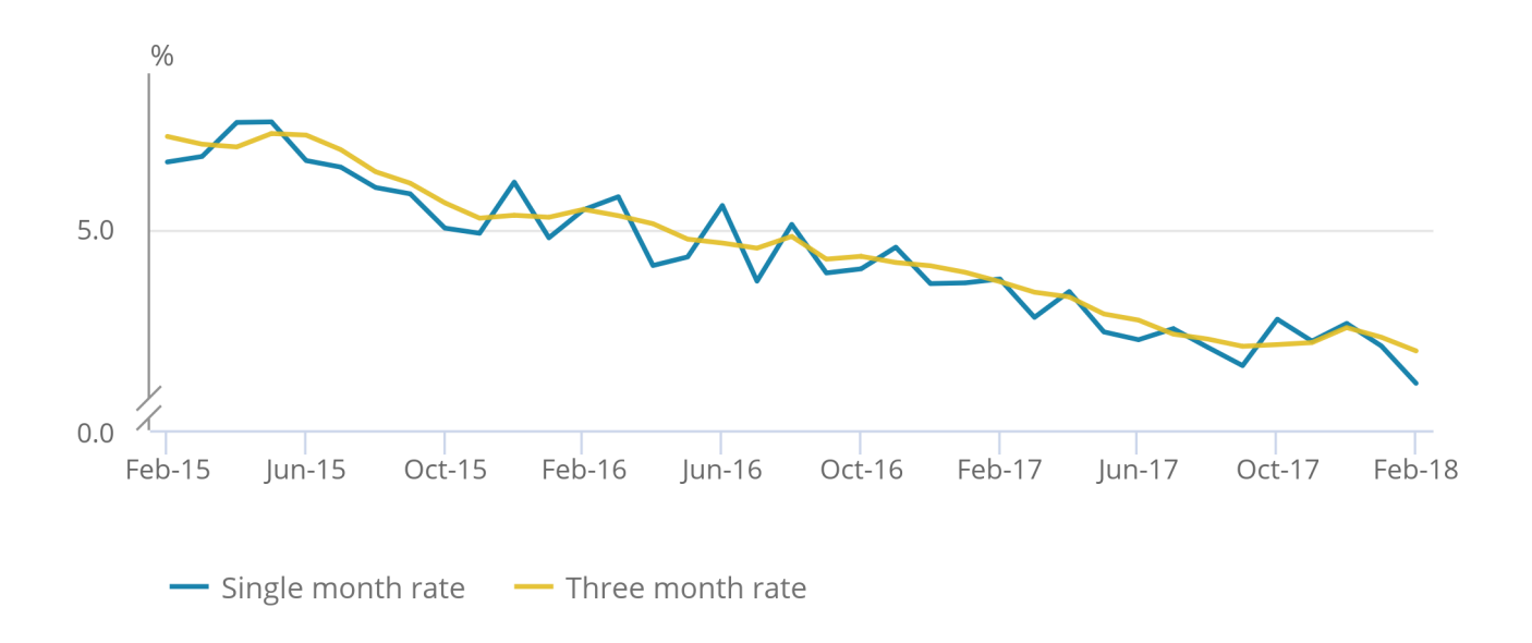
Figure 2: UK unemployment rates, ages 16 and over (seasonally adjusted), February 2015 to February 2018