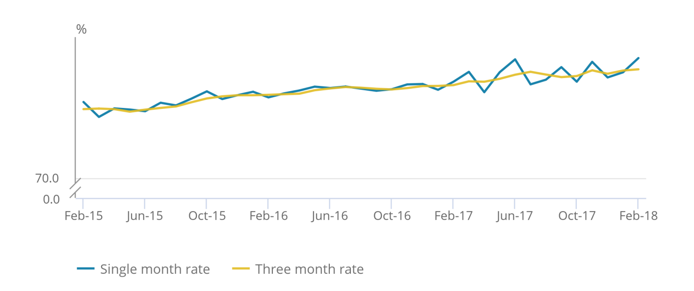
Figure 1: UK employment rates, ages 16 to 64 years (seasonally adjusted), February 2015 to February 2018