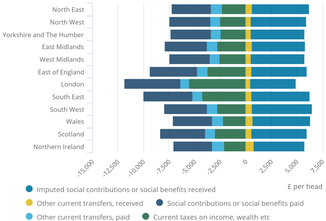
Figure 2: Components per head of the distribution of secondary income account by NUTS1 region, UK, 2016 1