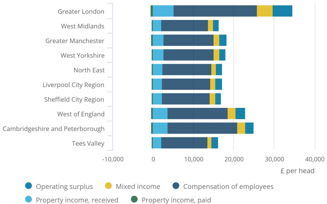
Figure 4: Components per head of the allocation of primary income account for UK combined authorities, 2016 1