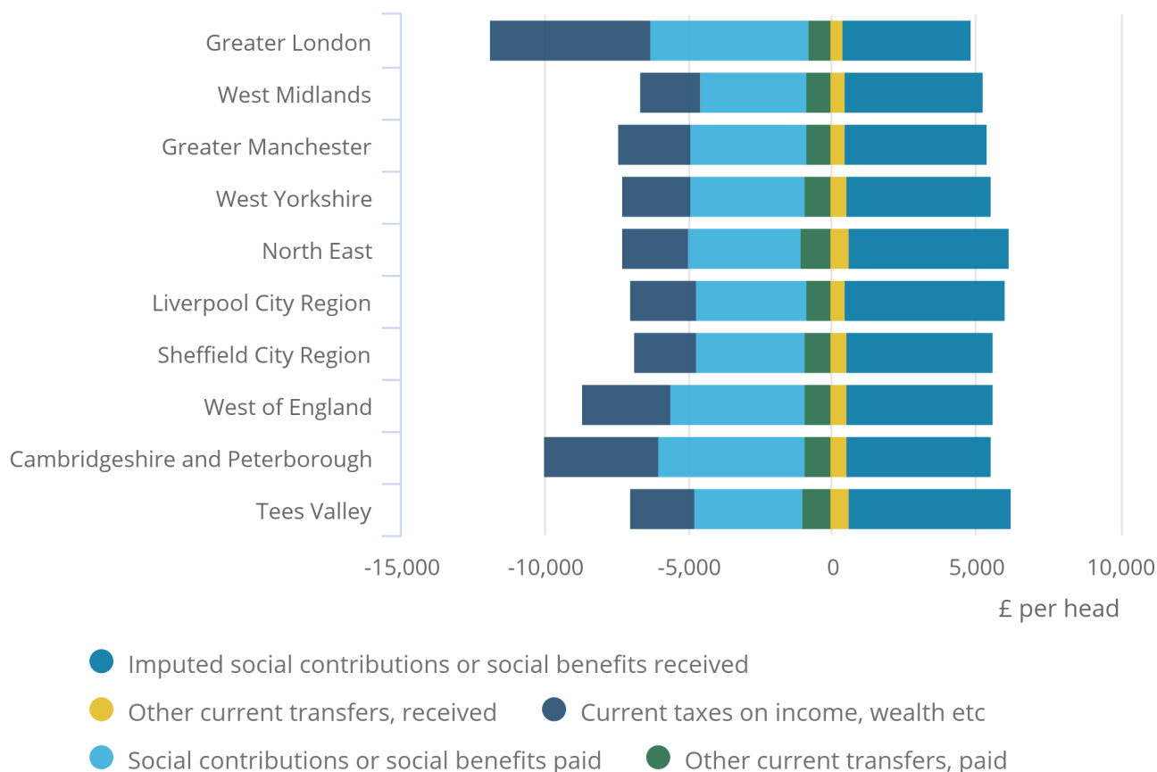
Figure 5: Components per head of the distribution of secondary income account for UK combined authorities, 2016 1