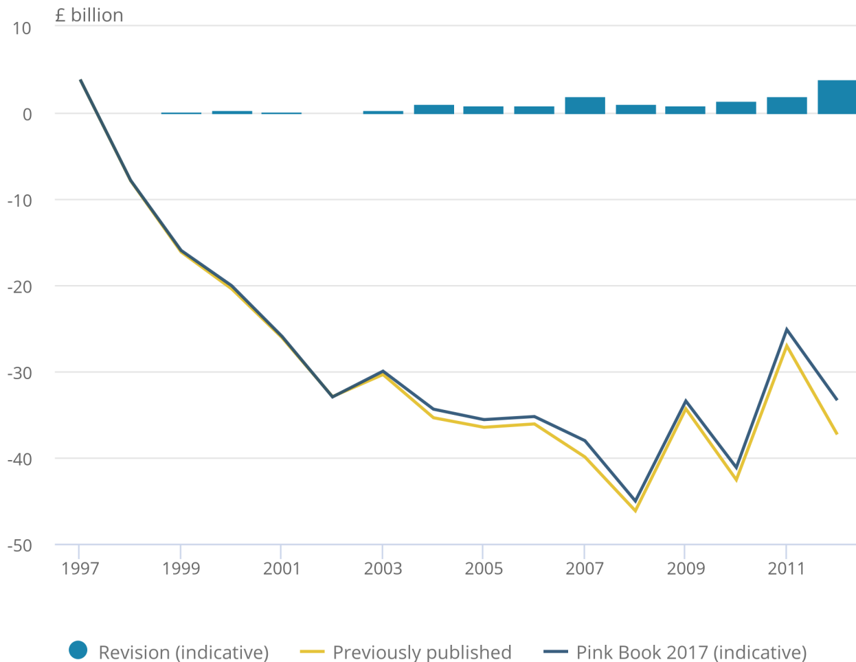
Figure 1: Indicative trade balance revision, UK, 1997 to 2012