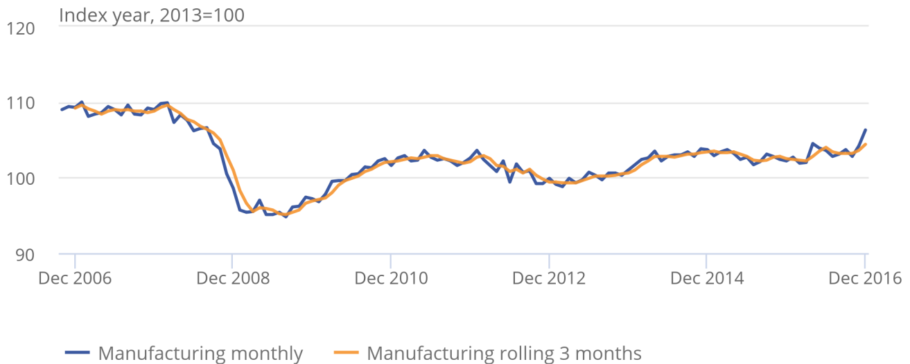
Figure 1: Seasonally adjusted index of manufacturing, December 2006 to December 2016, UK