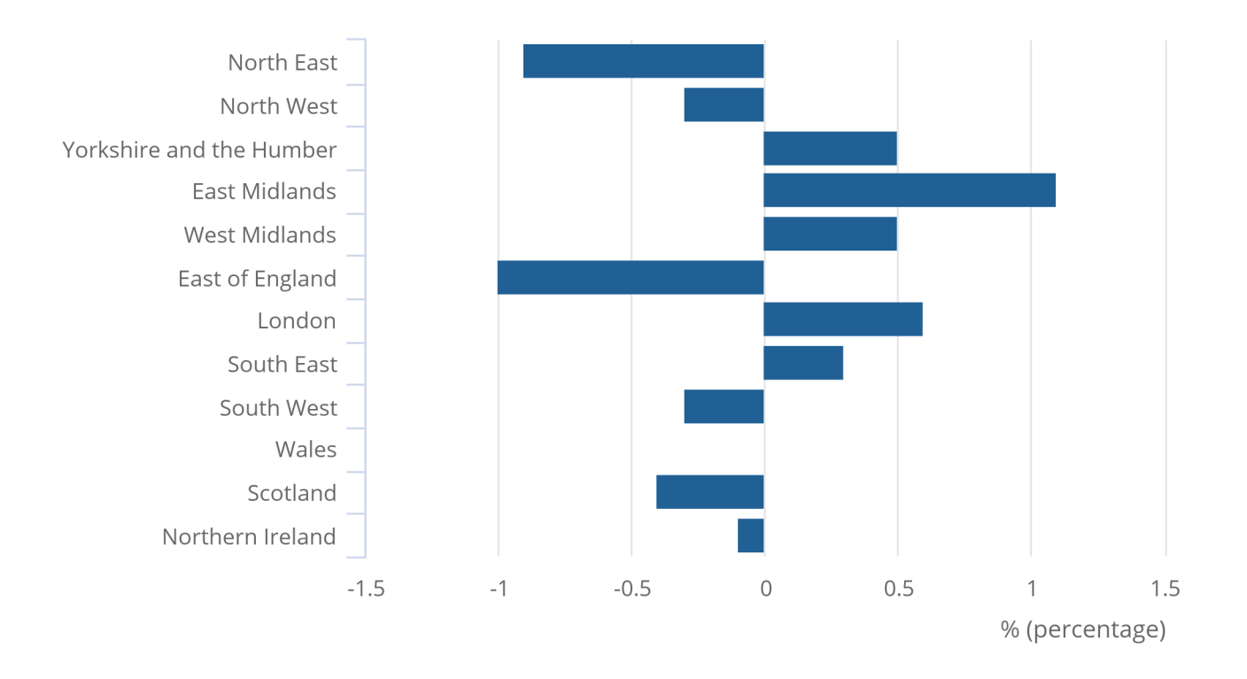
Figure 2: Research and Development intensity method percentage estimates compared with modelled percentage estimates