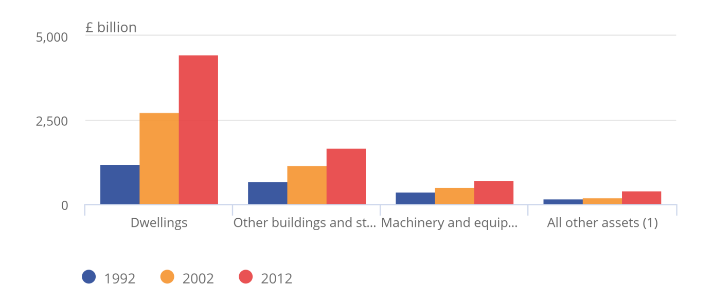
Figure 3: Value of non-financial assets, end 1992, 2002 and 2012, at current prices